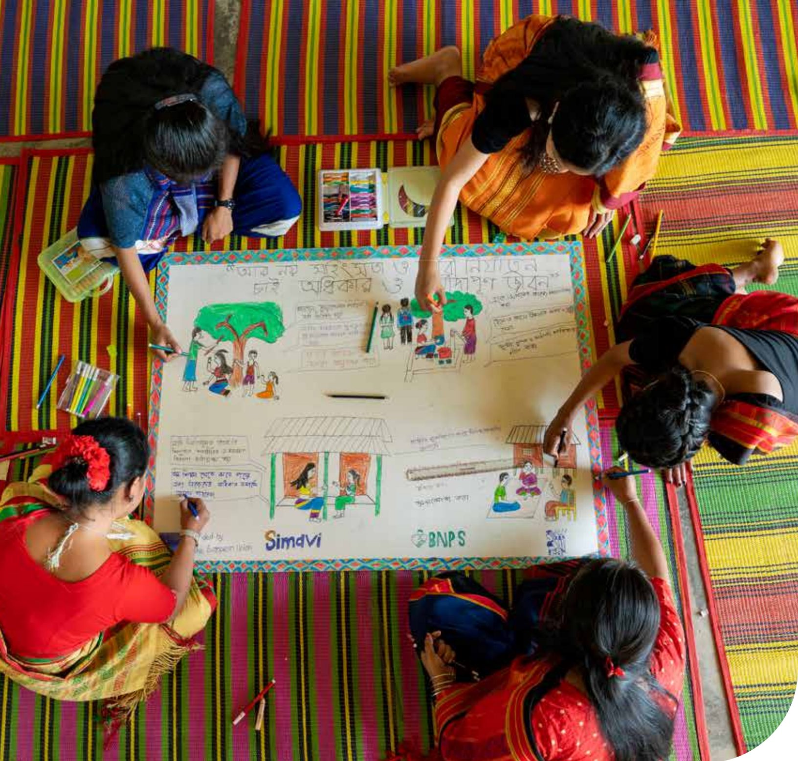
The adolescent girls from Moanghar Girls Club, Khagrachari are working on their poster presentation

My goal was to raise awareness about gender-based violence. I showed the posters to the parents in every family in my area, hoping this would convince them to provide both their sons and their daughters with equal opportunities.