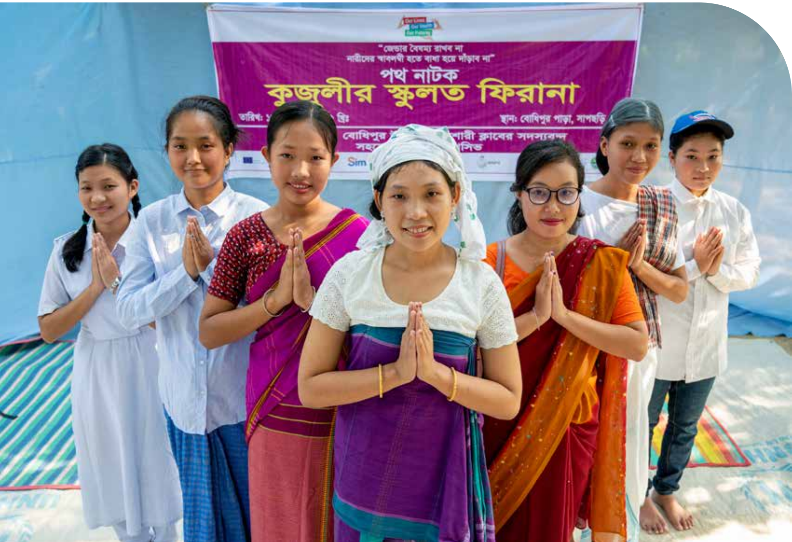
The group of young actors are bowing before the audience at the end of the street play

I now dream of a beautiful society where boys and girls are equal.