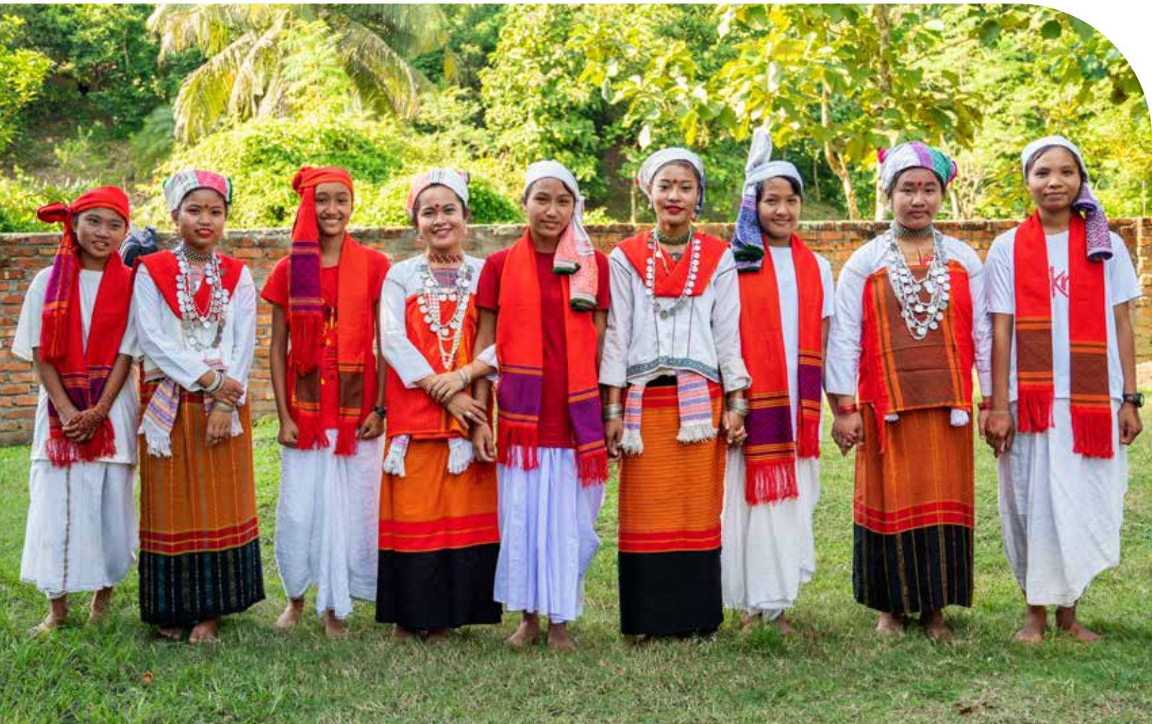
Young actors at the end of the drama about the negative impact of early marriage

My fellow club members and I put together a play with the slogan "Keep your emotions under control. Stay away from child marriage." The play spoke about how schoolgirls fall in love with boys and run away from home to get married. This could be very dangerous for young girls, especially if they do not have the support and protection of their families. They also experience health issues if they get pregnant while they are too young. I now know a lot about reproductive health, child marriage, and other related issues, and want to share this knowledge with others. I have also realised my value and want to be myself without any societal pressures holding me back.