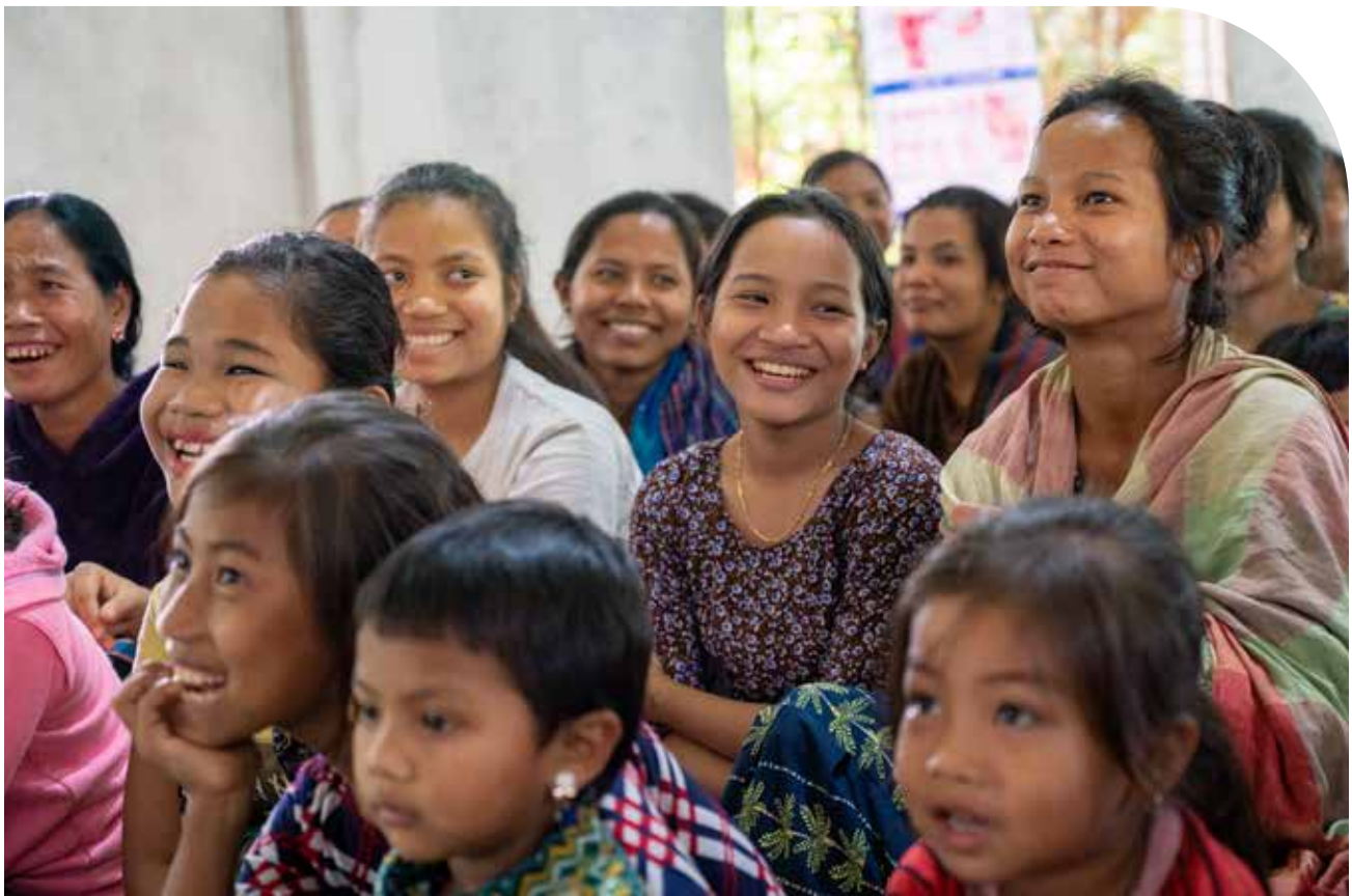
The audience watching the short drama on the negative impact of child marriage

Educating girls is more important than child marriage because when educated, a girl can study and support herself no matter what happens in her future. We made it a point to inform parents that they should prioritise their child's education. I am proud of the project's outcome and hope this conversation continues in the future.