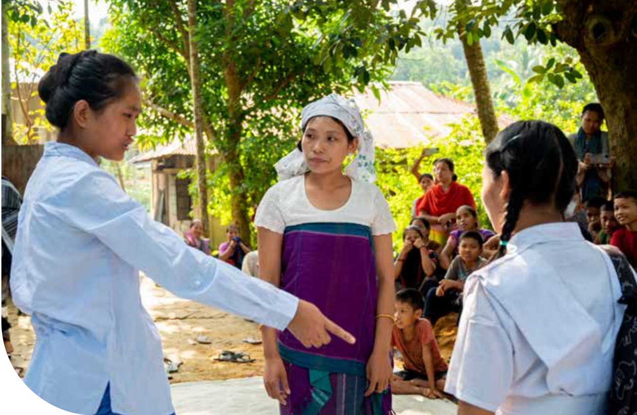
The adolescent girls portraying different characters in their street play on changing gender roles

While I have all these hopes and dreams, I find it difficult to get through my day because of the harassment I face. Commuting to and from college is a major issue in my area. Whenever I take public transport, boys sit uncomfortably close to me. Once, while I was out shopping, an old man approached me. He asked me for my WhatsApp number but I refused to give it to him.