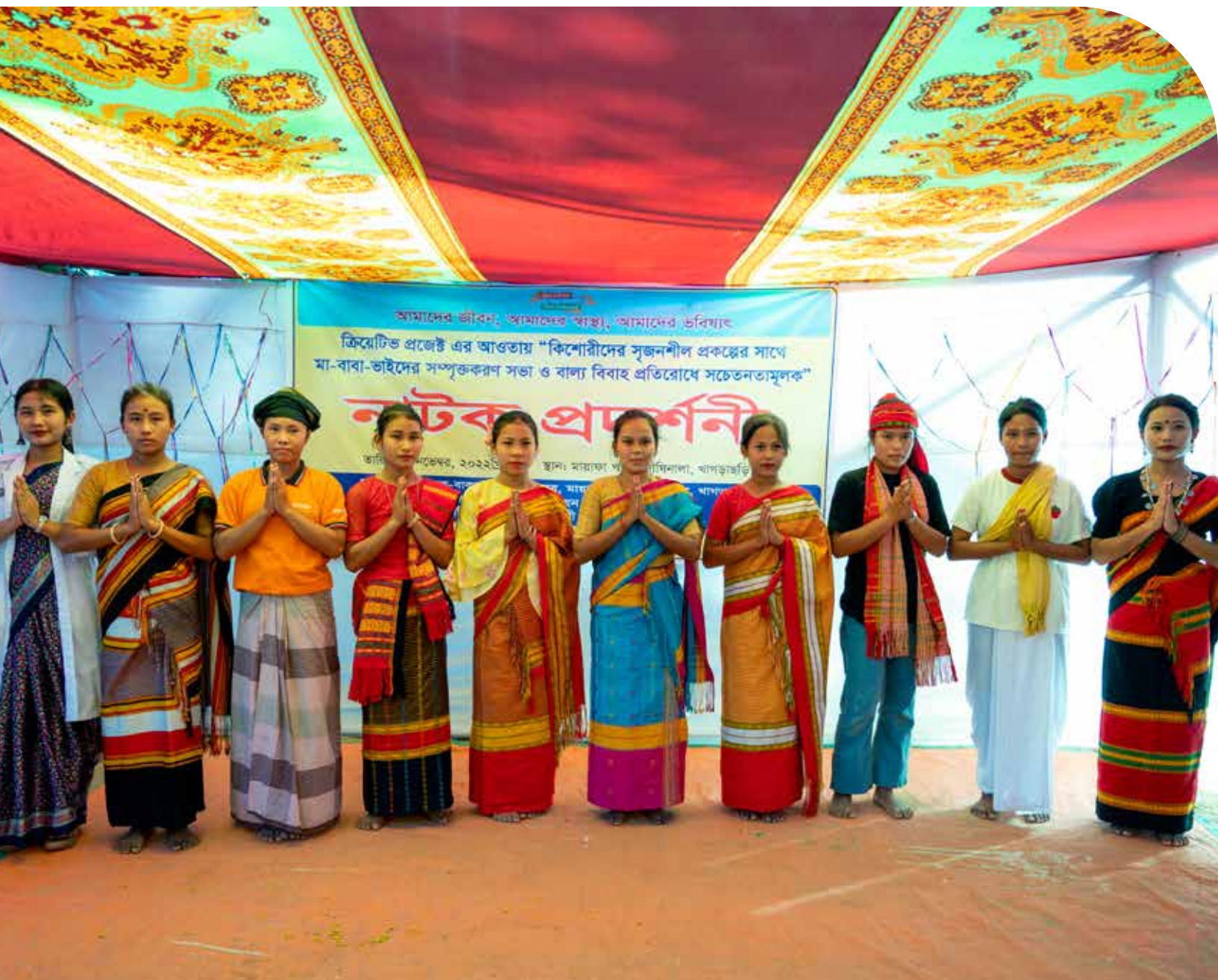
The adolescent girls from Kokbaksha Girls Club, Khagrachari during the end of their performance

I am glad I was able to educate some people in my community through the play. I hope to share this knowledge with our friends and neighbours to prevent child marriage.