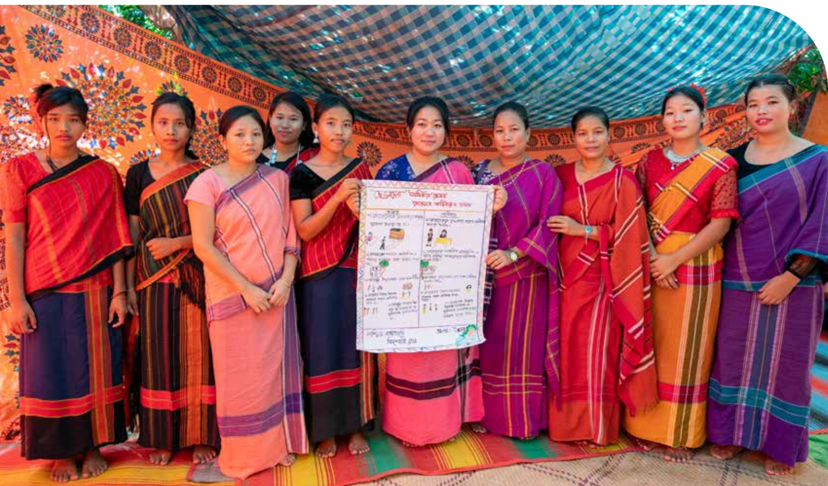
The girls from West Baghaichori Adolescent Girls' Club are showing their poster presentation to the audience

Safety and independence go hand in hand and I hope that people were able to realise this through our poster presentation.