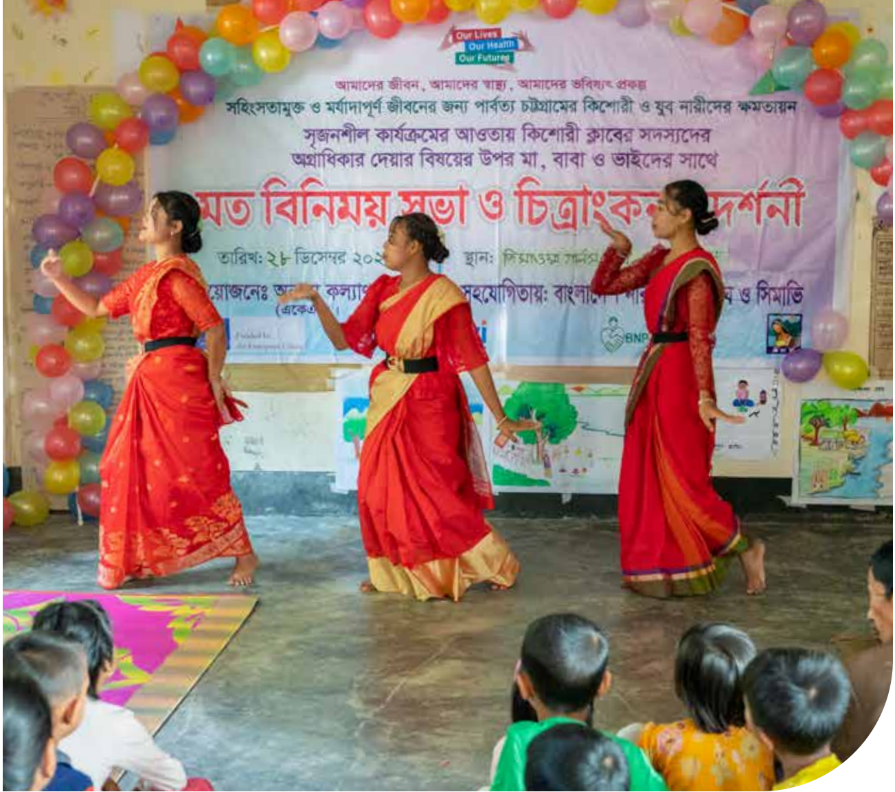
The girls are dancing during the event of poster presentation

After our presentation, I noticed some positive changes. My brother started assisting with household chores traditionally done by women and people listened to what I had to say.