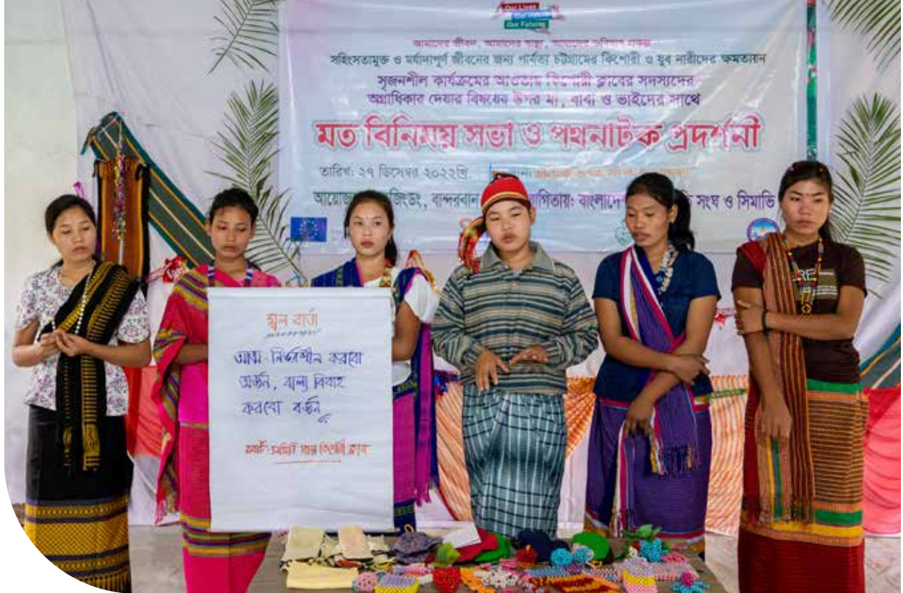
The performers at the end of their short drama on the negative impact of child marriage

Educating girls is more important than child marriage because when educated, a girl can study and support herself no matter what happens in her future. We made it a point to inform parents that they should prioritise their child's education. I am proud of the project's outcome and hope this conversation continues in the future.