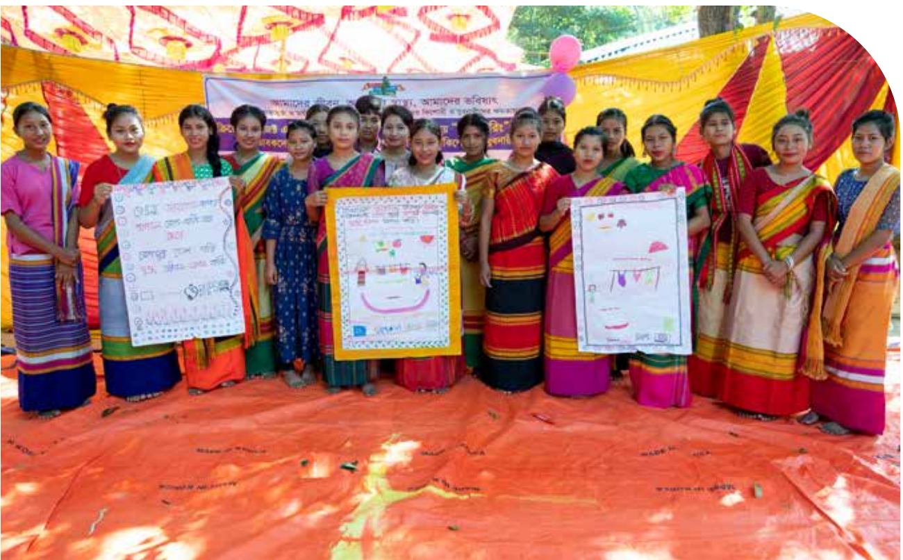
The members of the Montripara Girls Club, Khagrachari showing their poster presentation on menstrual health management

After I got my first period, I lost the freedom I had as a child. Whenever I go out, people always ask questions about where I am going, with whom, and for what. If I get home late, my neighbours gossip about it.