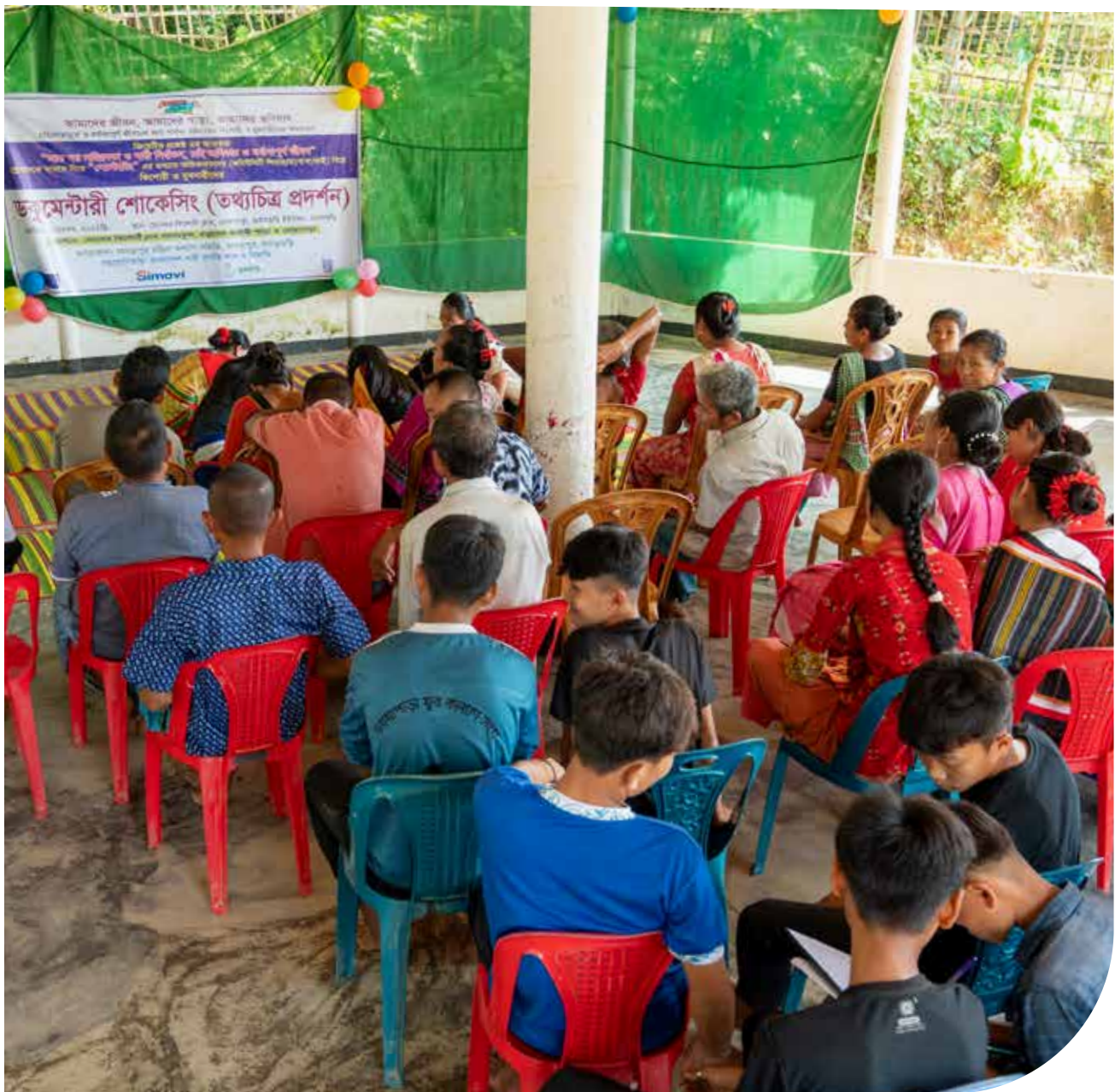
The audience at the poster presentation event organized by the girls of Moanghar Girls Club, Khagrachari

I enjoy wearing dresses but unfortunately, I get taunted on the streets when I do. I would love to go to the bazaar wearing the dresses I like but I end up feeling terrible because the boys there always tease me.