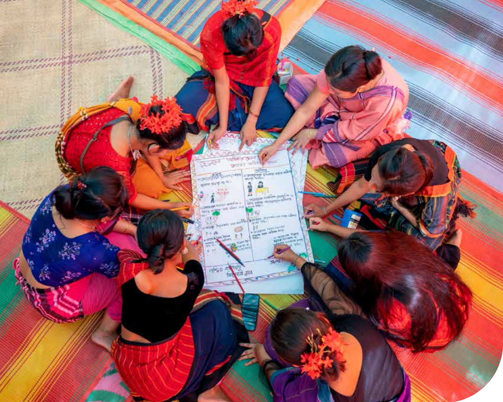
The members of the West Baghaichori Adolescent Girls' club almost finished their poster presentation

In my community, girls grow up, get married, and have to listen to their husbands. They say this is for our safety but I disagree. I want to be independent and take care of my parents instead.