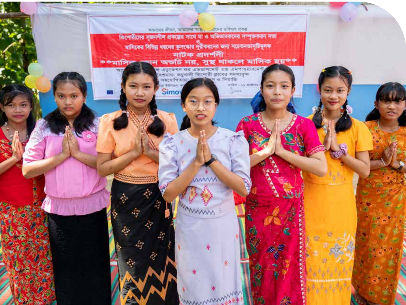
The girls from Kachukhali girls club after the performance

I hope that more people understand that menstruation is normal and that we must be understanding toward those experiencing it.